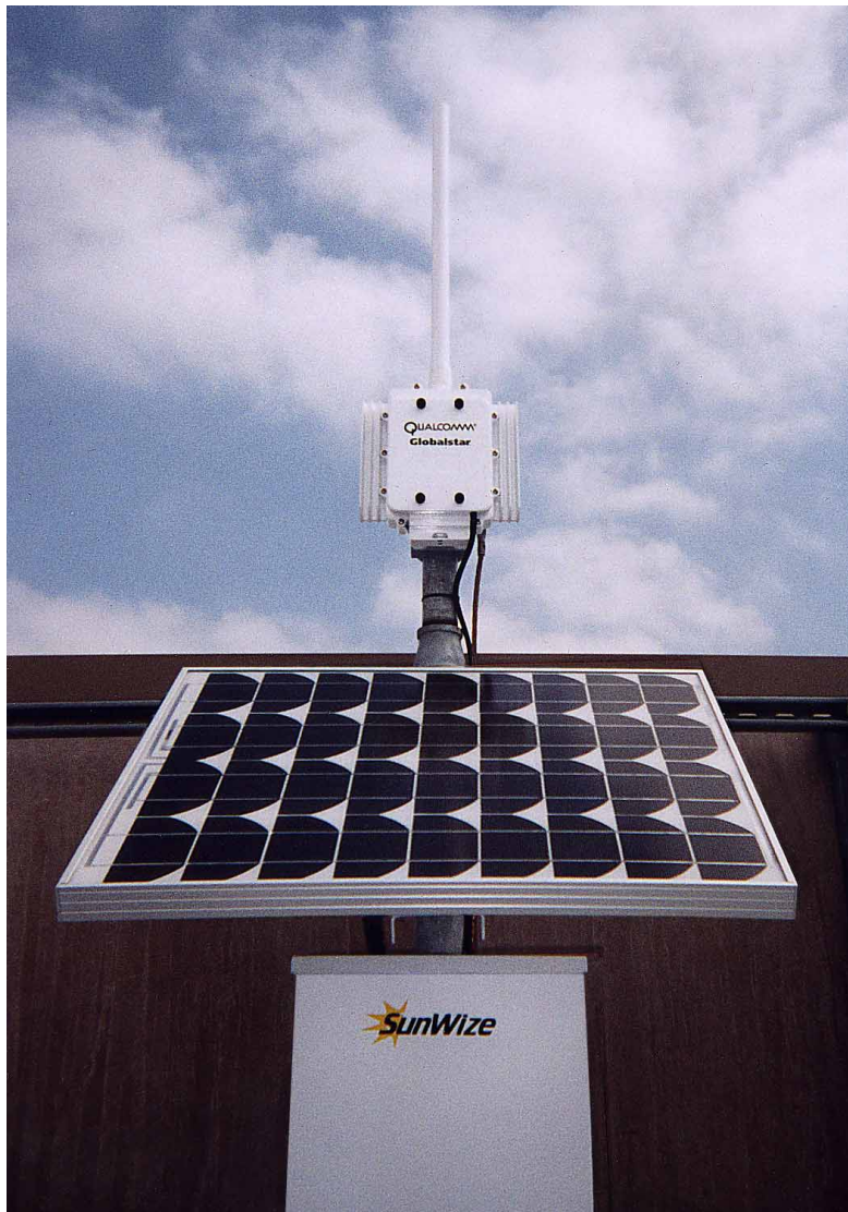
A SunWize Model QF Power Ready system is easily installed below the QUALCOMM radio antenna unit (RAU); like the RAU, the systems may be pole or wall-mounted, and must be installed with an unobstructed view of the sky.